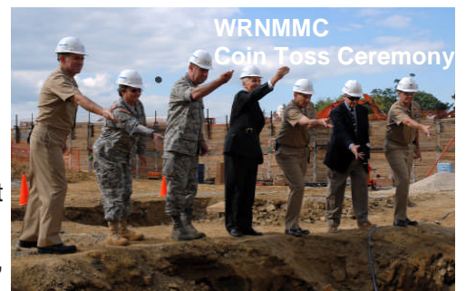
WRNMMC Coin Toss Ceremony