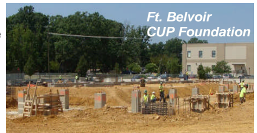
Ft. Belvoir CUP Foundation