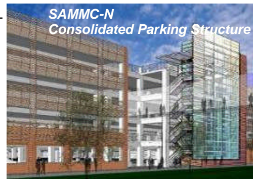
SAMMC-N Consolidated Parking Structure