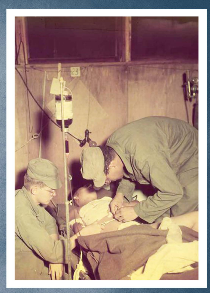
BLOOD TRANSFUSION AT MOBILE ARMY SURGICAL Hospital (Mash) Unit in 1950s

The ASBP has a mission of readiness. We are tasked with equipping service members in the heart of battle with the blood products they need, wherever and whenever they need them. Anyone receiving blood far forward and deployed to areas known and unknown is through us.