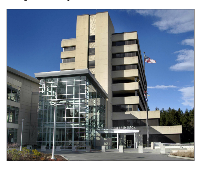
Naval Hospital (NH) Bremerton [Online image]. Retrieved May 5, 2016 from http://www.med.navy.mil/sites/nhbrem/pages/default.aspx

Following the MHS GENESIS<sup>SM</sup> announcement in April, the DoD Healthcare Management