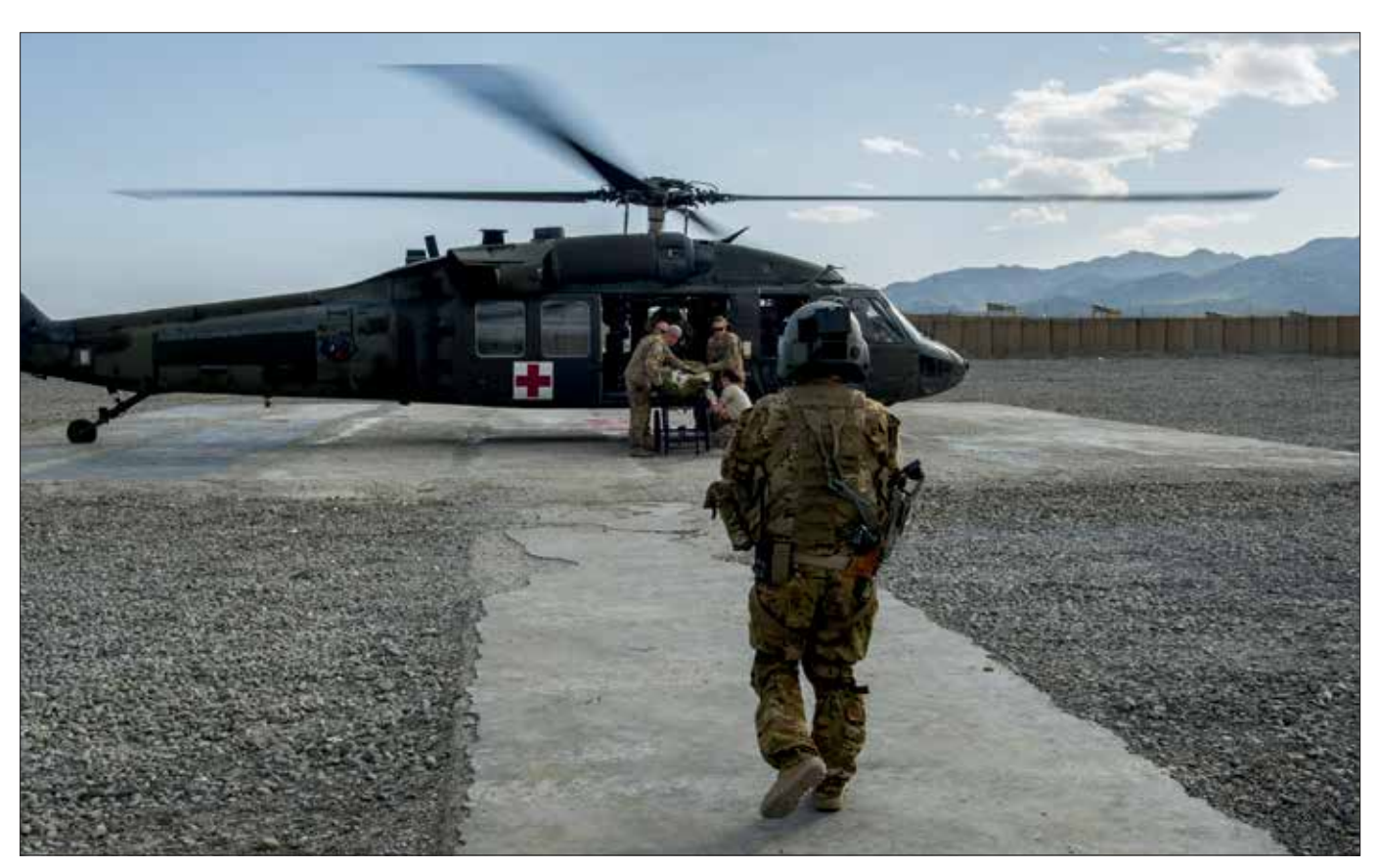
Tactical critical care evacuation team nurse (forefront) assigned to Army's 3<sup>rd</sup> Platoon, C Company, 2-149 General Support Aviation Battalion Medical Evacuation, prepares for patient transfer mission, May 13, 2013, at Forward Operating Base Orgun East, Afghanistan

techniques, and procedures (TTP). In this case, there were distinct differences in medical TTPs within the hospital command and control procedures and in the practice of trauma care between the United States and UK. In the vast majority of cases, these differences were not better or worse—just different. These differences in roles and responsibilities and in clinical medical practice were clarified in advance of deployment to ensure trust, cooperation, and smooth interoperability among international colleagues.