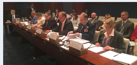
PEO DHMS, OEHRM, and IPO Leadership testifies before the House Committee on Veterans Affairs' Subcommittee on Technology Modernization.