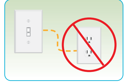
Do not use outlets that are controlled by wall switches.