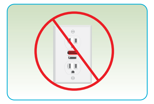
Do not use outlets that have built-in circuit switches (they have red reset buttons).