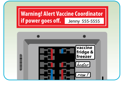
Label fuses and circuit breakers. Post a sign to alert the Vaccine Coordinator any time the power goes out.

If you experience a power failure, do not open refrigerator/freezer doors. If you determine that power will not be restored in time to maintain internal temperatures within recommended ranges, e.g. more than 2 hours, activate your emergency plan.