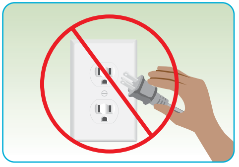
Never unplug the vaccine refrigerator or freezer.