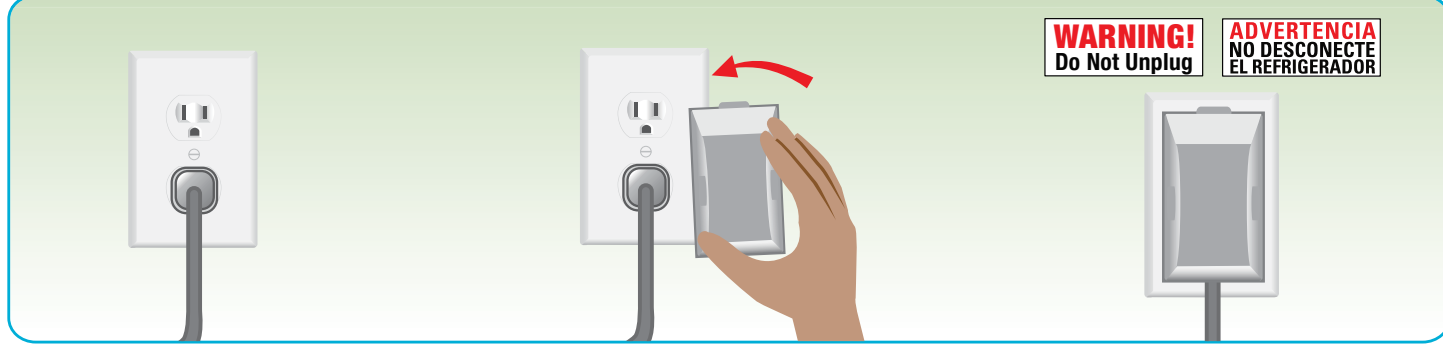
Plug in vaccine storage unit to a nearby outlet.