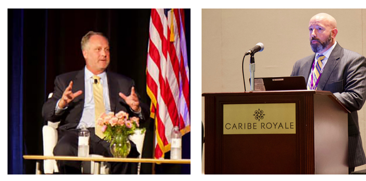
PEO DHMS leadership speak at the 2019 DHITS.

In July, the Program Executive Office, Defense Healthcare Management Systems (PEO DHMS) and its program management offices (PMO) presented briefs, product demonstrations, and a keynote address at the 2019 Defense Health Information Technology Symposium (DHITS). DHITS provides the opportunity to collaborate on the future of health IT, bringing together a variety of stakeholders from across the Military Health System.