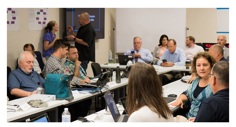
DHMSM at work in the MHS GENESIS Go-Live command center, ensuring a smooth transition.

In 2009, the Obama administration directed DoD and the Department of Veterans Affairs (VA) to develop a joint virtual lifetime EHR to enable a seamless transition for service members entering veteran status. Through their collaborative efforts, DoD and VA determined their organizations had