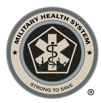
Do not reverse out the logo