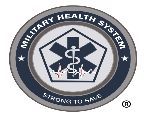
Do not scale the logo in a way that elongates the mark.