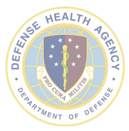
Do not tint the logo colors