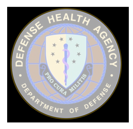
Do not reverse out the logo