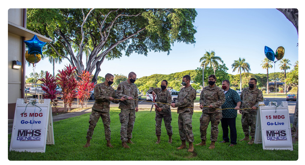
15th MDG members cut cord during the MHS GENESIS launch ceremony at Joint Base Pearl Harbor-Hickam, HI.

The DHMSM program office and LDPH deliver MHS GENESIS more smoothly with each deployment, and Wave TRIPLER is a prime example. On September 25, the DHMSM program office and LDPH successfully delivered MHS GENESIS to an additional 4,800 clinicians and other providers throughout 130 locations in Hawaii. Known as Wave TRIPLER, this was the department's seventh wave. It brings the total number of locations live on MHS GENESIS to over 1,000 and the number of active users to approximately 65,000. Holly Joers, PEO DHMS, applauds the teams for their commitment and says, "In the midst of the pandemic, the MHS GENESIS team along with the staff at these locations remain committed to delivering a single, common federal EHR." The new EHR provides enhanced and secure technology to manage health information and serves as a focal point for all military branches. The DHMSM team deploys MHS GENESIS across the continental United States and overseas through a total of 23 waves, each targeting a specific region. This approach enables the DoD to take full advantage of lessons learned from prior Waves to streamline subsequent Waves. PEO DHMS expects full deployment of MHS GENESIS by the end of the calendar year 2023.