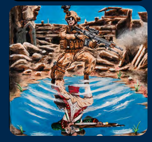
Creative Forces' online exhibit includes art from ISC patients at Camp Lejeune ( Lakota, top; Traditions Reflected, bottom) and Fort Belvoir ( Untitled 8, middle).

Specialized mental health care is critical for continued recovery from PTSD, anxiety, and depression, and the VA offers a wide variety of treatment options as well as peer liaisons, telehealth, and other tools. While continuing professional treatment is essential for Network patients, peer networks provide something professionals cannot.