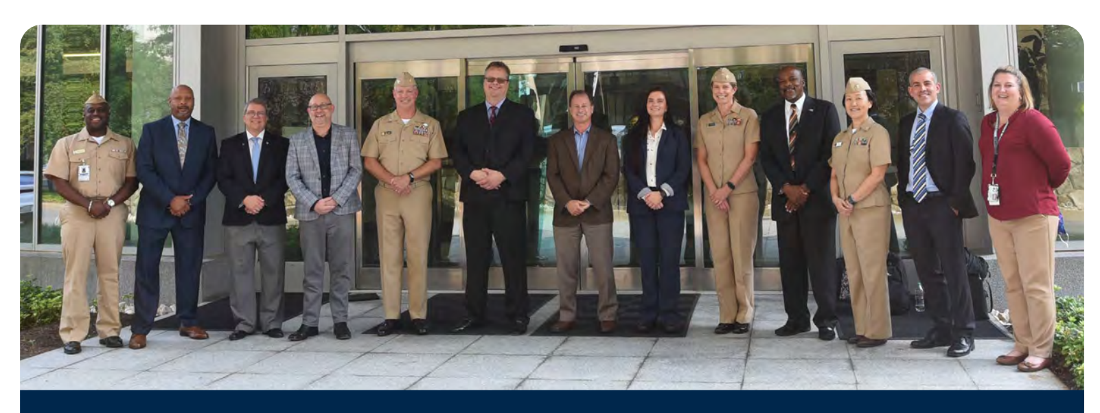
Network directors, joined here by NICoE officials and DHA leaders, gather at the NICoE for the Defense Intrepid Network Fall Meeting, held Sept. 14-15, 2021.

In the coming months, the work will continue as Network representatives develop a Plan of Action & Milestones (POA&M) to achieve Program of Record status. Over the next several months, the team will be working diligently to establish the Concept of Operations (CONOPS) for the Network, the governance framework, MOUs, and the DHA Interim Procedures Memorandum (IPM) and Procedural Instruction (PI).