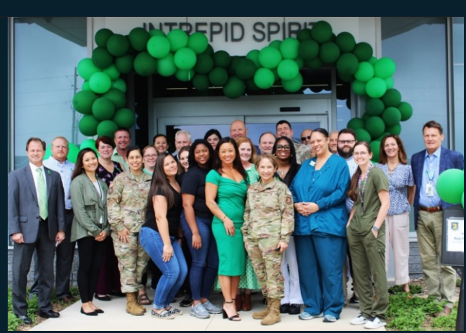
Staff at the Eglin ISC at the Brain Injury Awareness Manth Kick-Off this past March.

I have one ask for anyone who reads this...I would include a focus on post-traumatic stress, just about anyone with a TBI is about guaranteed to have PTS. have benefited greatly in addressing both during my month of treatment and it is also comforting to know I have therapists I can talk to as I process through a lot of learning about ways my vestibular system was impacted by TBIs.